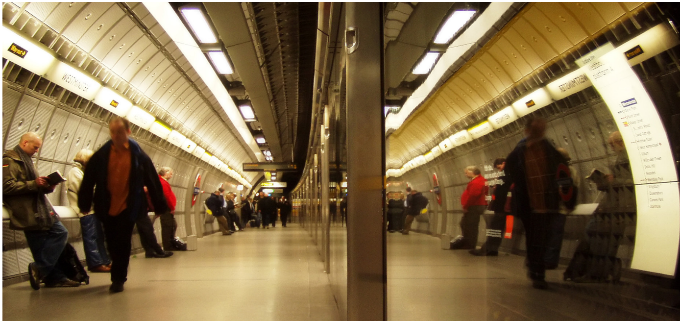
The London Tube serves millions of London citizens monthly through its iconic stations

first map, published in 1908, betrayed the fact that different operators were competing with each other and could not agree where the Underground ended. Harry laid out London’s Underground routes as he would a circuit board, and took it to the publicity department. He told Garland: “Looking at the old map of the railways, it occurred to me that it might be possible to tidy it up by straightening the lines, experimenting with diagonals and evening out the distances between stations.”