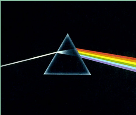
Pink Floyd - Dark Side Of The Moon (1973, Harvest records) Designer: Hipgnosis