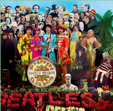
The Beatles - Sgt. Pepper's Lonely Hearts Club Band (1967, Apple Records)