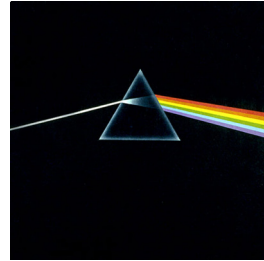
Pink Floyd, 'Dark Side of The Moon' (1973, Harvest Records)

Hipgnosis had designed several of Pink Floyd's previous albums, with controversial results: the band's record company had reacted with confusion when faced with the collective's non-traditional designs that omitted words. Their initial inspiration for Dark Side was a photo of a prism on top of some sheet music. It was black and white, but a color beam was going through it. Hipgnosis presented the prism design along with some others ideas to the band.