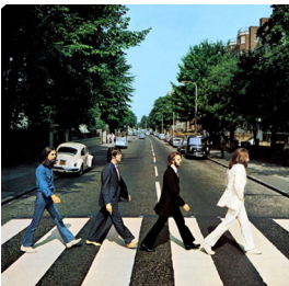
The Beatles, 'Abbey Road' (1969, Apple Records)

Beatles nuts who believed that Paul McCartney died around 1967 and was replaced by a doppelgänger found a lot to examine on this cover. They saw the picture as a funeral procession: John as the preacher, Ringo as the mourner, George as the gravedigger and barefooted Paul as the corpse. Iain Macmillan shot the cover on August 8th, 1969, outside of Abbey Road studios. The shoot involved just six frames and 10 minutes of work. Tourists flock to the spot, and it's been parodied countless times.