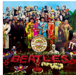
The Beatles, 'Sgt. Pepper's Lonely Hearts Club Band' (1967, Apple Records)

The cover was originally going to show the Beatles playing in a park. That slowly evolved into the final concept, where they stand amidst cardboard cutouts of their heroes. The band originally planned on including Leo Gorcey, Gandhi, Jesus Christ and Adolf Hitler. Common sense kicked Hitler off the cover, the still-lingering bitterness of John Lennon's "bigger than Jesus" comment eliminated Jesus and Gandhi got the boot over concerns that India wouldn't print the album.