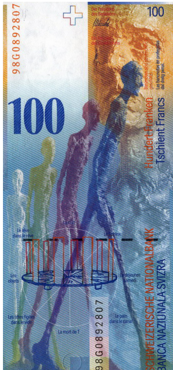
Giacometti's sculpture L'Homme Qui Marche was featured on the Swiss Franc beginning in 1998

Now he was able to enlarge his figures, but he found that as they became taller they lost heft, becoming inevitably more slender. It was thanks to these elongated, pointy figures with heavy feet that he swiftly rose to fame. He had some money now, though he insisted on living in his studio, refusing to indulge Annette in her desire for an ordinary home. He became acquainted with many of Paris's most exciting writers and artists. He drank in cafes with Jean-Paul Sartre and Simone de Beauvoir, went for late night, largely silent walks with Samuel Beckett, and became a regular –