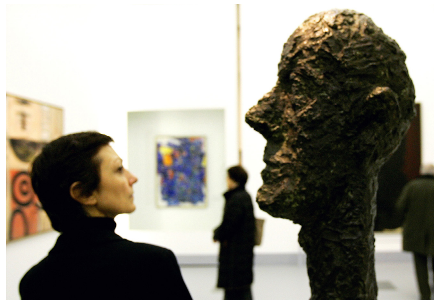
A visitor looks at “Grande Tête” (Big Head), a 1960 sculpture by Alberto Giacometti, as part of the Duncan Phillips Collection exhibition at the Luxembourg Museum in Paris.